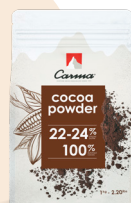
CARMA® Cocoa Powder 22-24% 1 kg • DCP-22H05-CAE6-89B