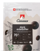
CARMA® Dark Edelbitter 70% 1.5 kg • CHD-Q028EDBIE6-Z71