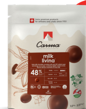
CARMA® Milk Livina 48% 1.5 kg • CHM-K020LIVIE6-Z71