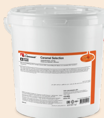
CARMA® Caramel Selection 13 kg • FWF-518CARASEC-Z51