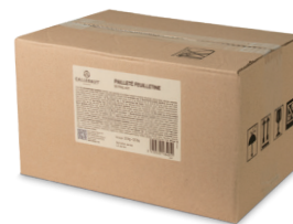
Callebaut® Pailleté Feuilletine™ 2.5 kg • M-7PAIL-E0-401