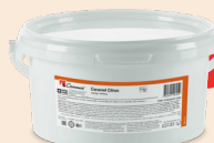
CARMA® Caramel Citron 2.5 kg • FWF-519CACIT-Z54