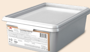
CARMA® Carmaduja Almond. light 7 kg • GID-I10HAZ-Z90