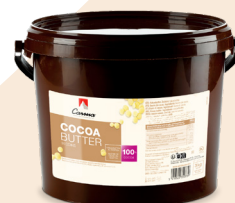
CARMA® Cocoa Butter drops 3 kg • NCB-HD703-CA-654