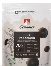
CARMA® Dark Venezuela 70% 1.5 kg • CHD-PI03VEN-E6-Z71