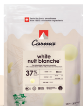
CARMA® White Nuit Blanche 37% 1.5 kg • CHW-NI53NUBLE6-Z71