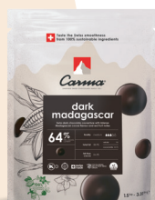
CARMA® Dark Madagascar 64% 1.5 kg • CHD-N089MAD-E6-Z71