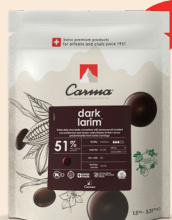
CARMA® Dark Larim 51% 1.5 kg • CHD-Q040LARIE6-Z71