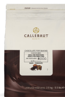
Callebaut® Dark Chococubes, bake stable 2.5 kg • CHD-CU-7Y1-E5-U70