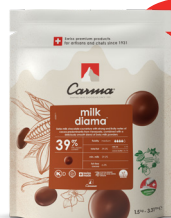
CARMA® Milk Diama 39% 1.5 kg • CHM-N015DAMAE6-Z71