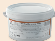
CARMA® Hazelnut Paste, for flavouring 2.1 kg • FRN-065NOSOR-Z60