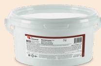
CARMA® Almond Paste 1:1 2.5 kg • PWN-AL570MASII-Z54