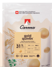
CARMA® Gold Quintin 31% 1.5 kg • CHW-R118GOLDE6-Z71